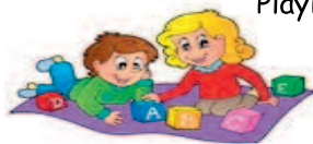
Playing with bricks/lego