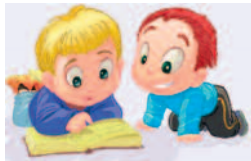
Books and Stories