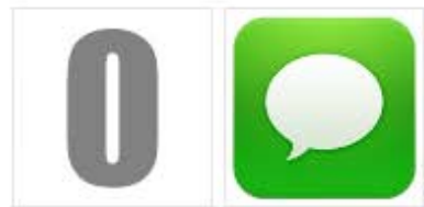
SMS Text Messaging

Some of these you may have seen on your child's device, but did you know the actual rating?